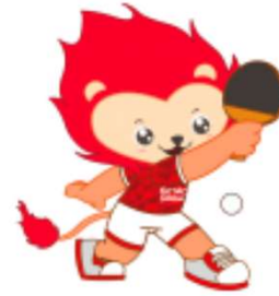
Table Tennis Team Managers Briefing